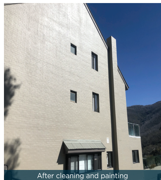
After cleaning and painting