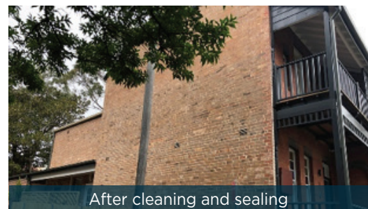
After cleaning and sealing